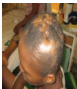
Figure 4: Post-craniectomy appearance