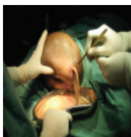
Figure 3: Intra-operative – Incision and drainage