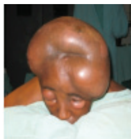
Figure 2: In the operating suite